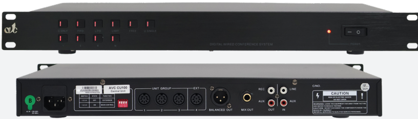
CU100 Central Unit

CU100 is a versatile conference system controller featuring an integrated power supply. It manages up to 45 delegate units out of the box with each trunk able to connect to 15 units. Using multiple CU100, your system can be scaled to 255 units for larger venues.