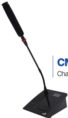
CM100 Chairman Unit