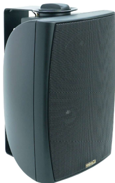
FS425 4" 20W 100V IP65

4" 20W 100V / 6" 40W 100V FS420 / 640 4" 20W 100V FS425 2x 4" 40W 100V FS338