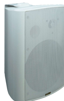
FS420 ( B/W) 4" 20W 100V ( Black / White ) FS640 ( B/W) 6" 40W 100V ( Black / White )

Classic full range speakers available in two variants as well in black or white colours to suit installation area.