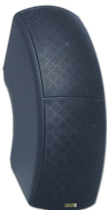
FS338 2 x 4" 40W 100V

Carton : 370 (L) x 370 (W) x 600 (H) mm Gross Weight : 20.30 kg 8 uts per carton